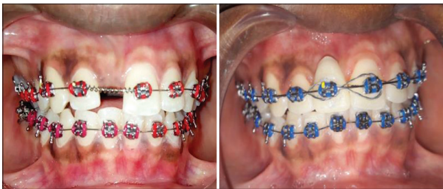
Figure 2: During treatment.

It is apparent that people cannot enjoy complete social and mental well-being if their mouths are esthetically displeasing. [13] The loss of anterior teeth has serious functional, esthetic disabilities in addition to compromising the patient's quality of life. [1,6] As regard functional disability, Runte et al. [12] in their study found that the tongue comes into contact with the teeth, alveolar ridge, or hard palate during articulation of speech sounds. Absence of teeth may cause a changed perception and may alter tongue movement or position which is helpful in the production of speech. [11]