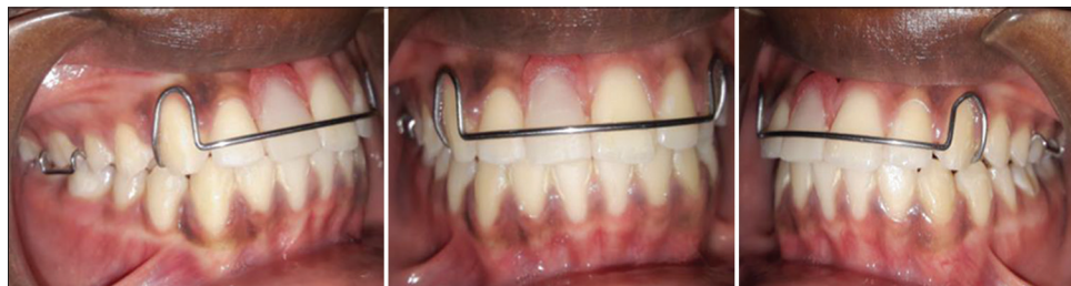
Figure 3: After treatment.

There is a need for a definitive fixed prosthesis which could be an implant or bridge.